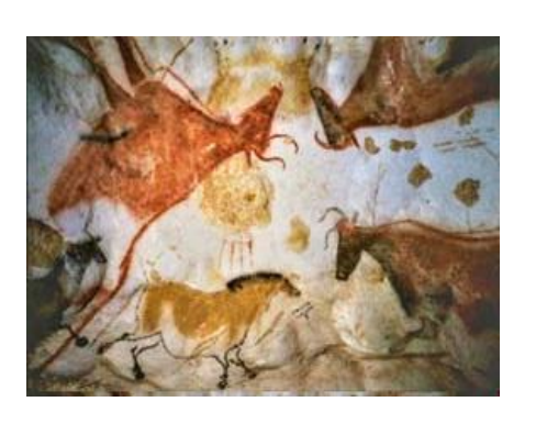
Lascaux Cave, ca 18,000 BCE, France

There are hundreds of images in the caves and thousands of years between the creation of many of them.